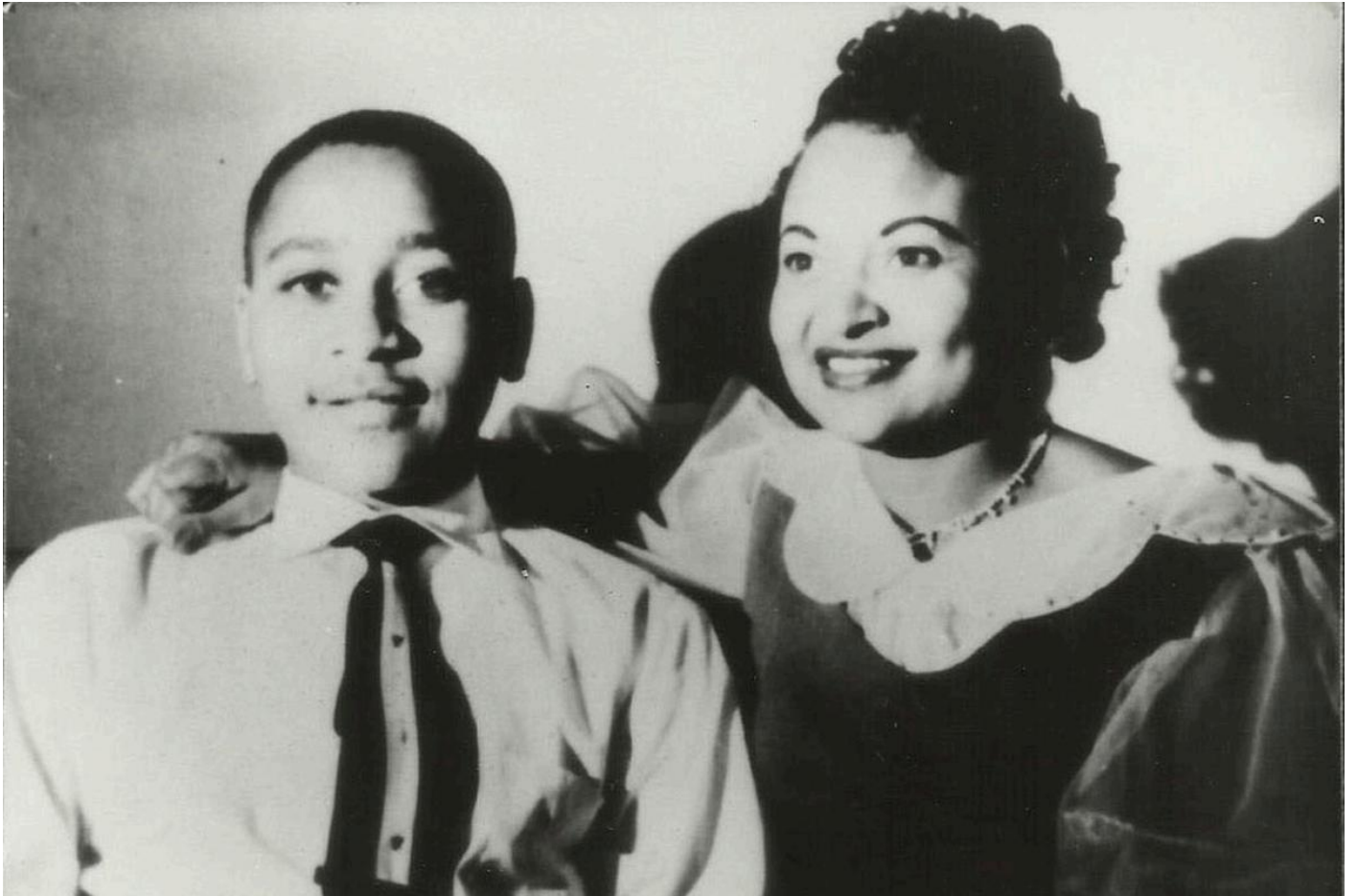
Mrs. Mamie Till-Mobley (right) with her son Emmett Till (left).

RACIAL RECONCILIATION BEGINS BY TELLING THE TRUTH