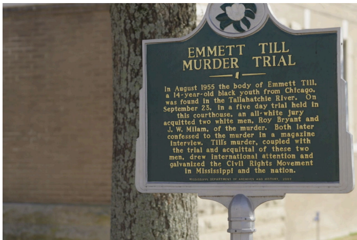
Restorative justice in Sumner, Mississippi